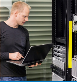
Business, Commerce and IT