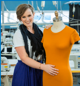
Fashion and Music