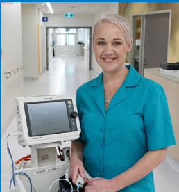
Health and Community