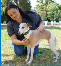
Animal Studies, Horticulture, Agriculture, Laboratory Sciences and Landscaping