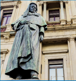
Justice and Legal