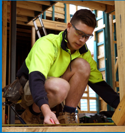
Apprenticeship and Pre-Apprenticeship training