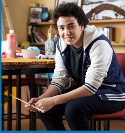
Indigenous Cultural Arts