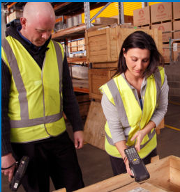
Trades and Logistics

Our diverse study areas offer something for everyone.