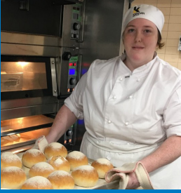
Hospitality and Retail Baking

View our full range of courses online: kangan.edu.au/courses